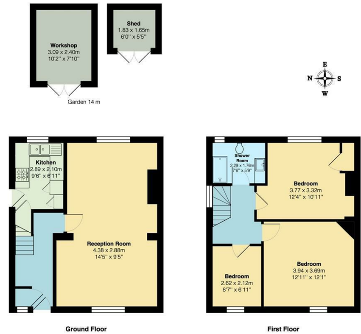
Total Area: 98.3 m 2 ... 1058 ft 2 All measurements are approximate and for display purposes only